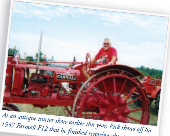
1937 Farmall F12 that he finished restoring about a year ago.